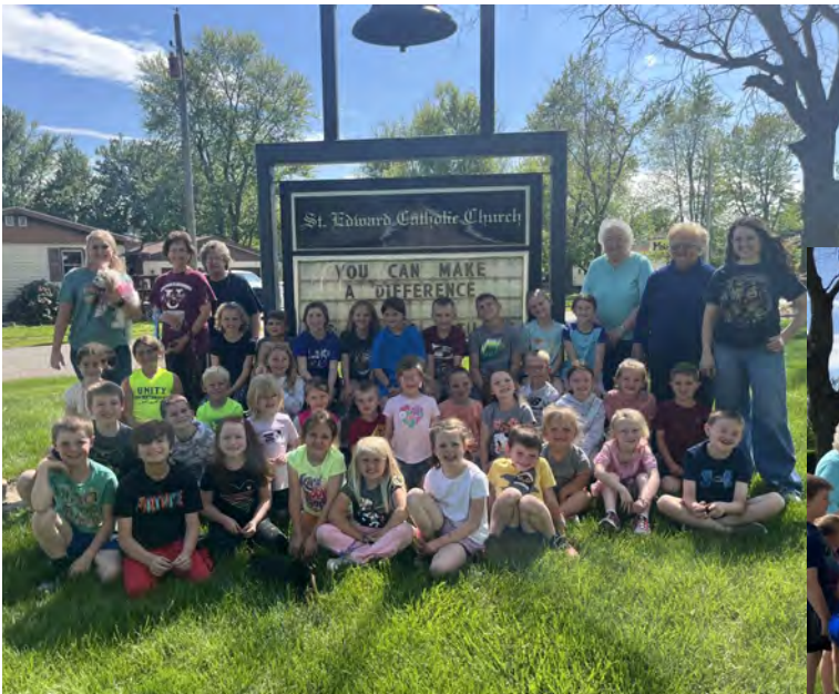
2024/2025 K-4 Catechists and Students!

We had a great last day of K-4 PSR celebrating the May Crowning!